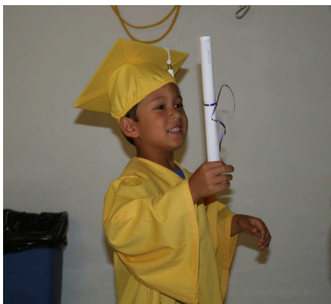
Graduation Day at Childgarden, a UCP Easter Seals and St. Louis ARC Child Development Center.